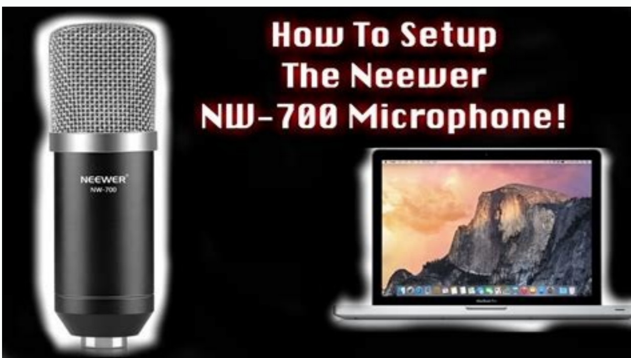
Neewer nw-700 setup windows 10. Neewer manuals. Neewer nw-700 software. Neewer nw-700 setup. Neewer nw-700 manual.